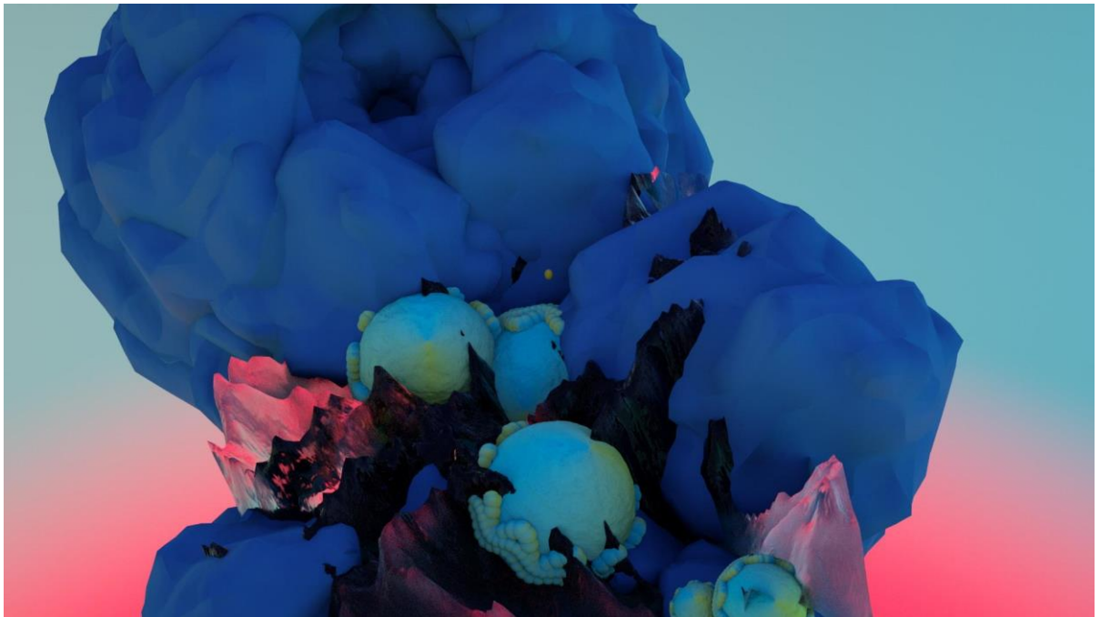
Sustainable Data 1.0 © veeeky wei chia wu, digital image, 2017