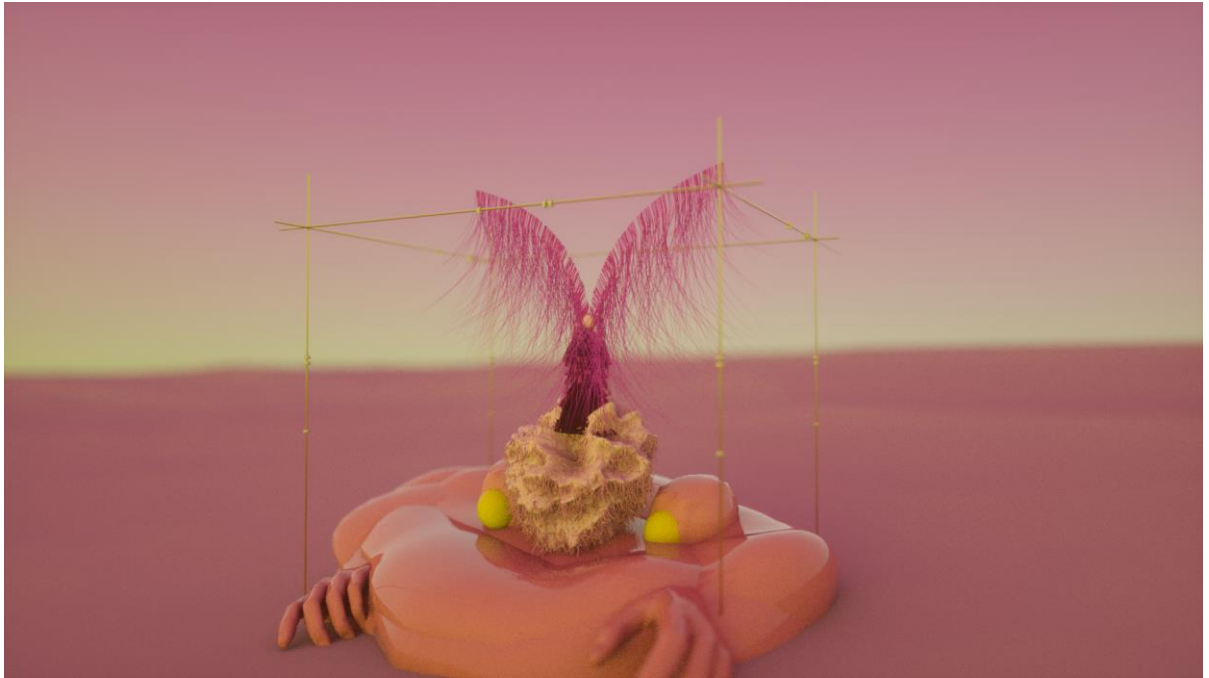
Sustainable Data 1.0 © veeeky wei chia wu, digital image, 2017