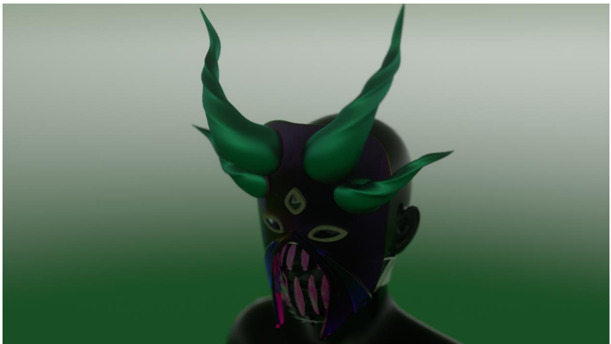
Sustainable Data 3.0 © veeeky wei chia wu, digital image, 2019

She manages and publishes the art writing magazine of HAGAI 花開. http://hagaihuakai.com