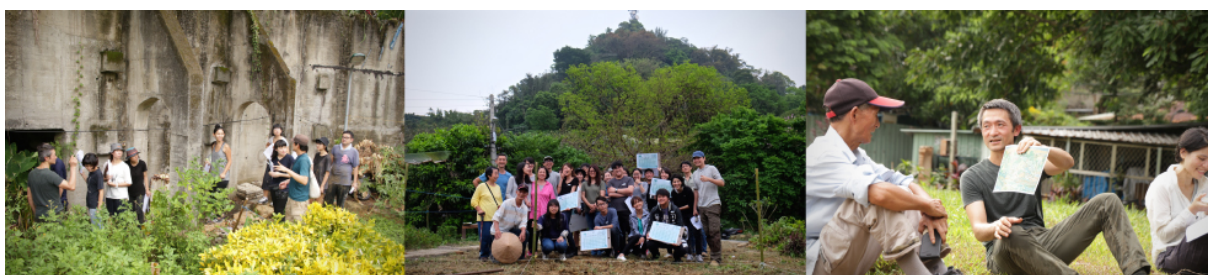
Toad Commons , 2016

During the opening on September 3, we will depart from TheCube Project Space at 4pm to visit Toad Commons.