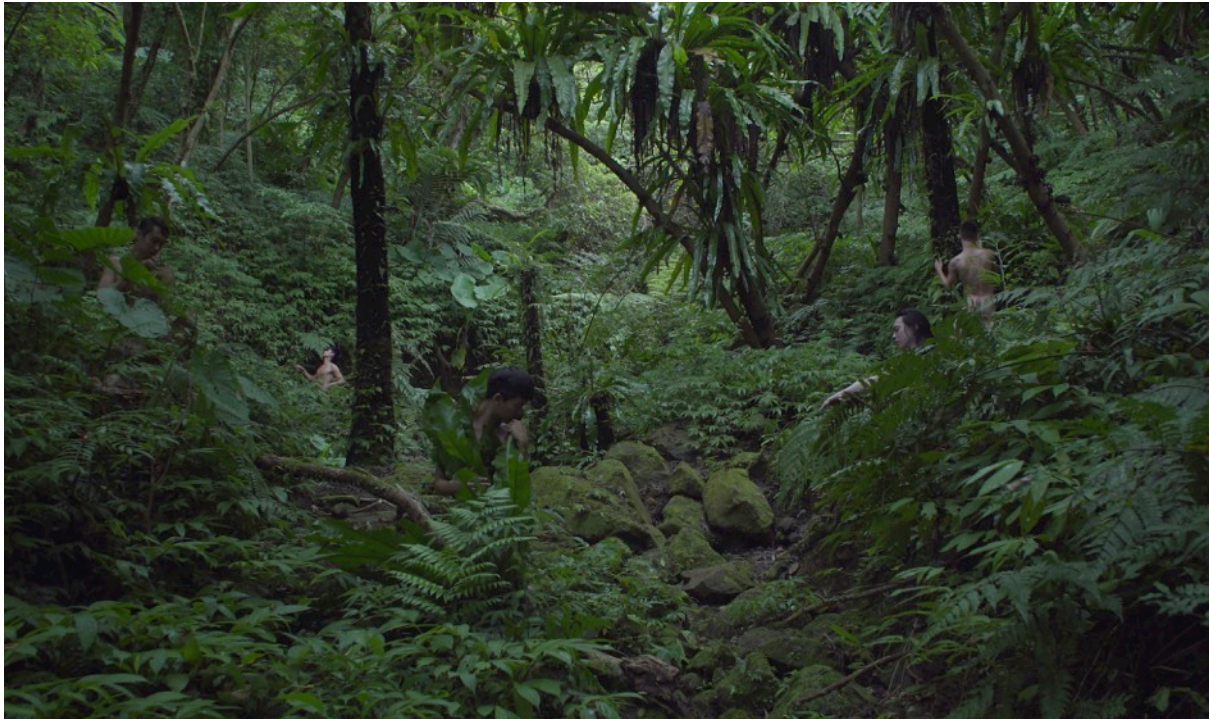
Pteridophilia , video (4K, color, sound), 2016