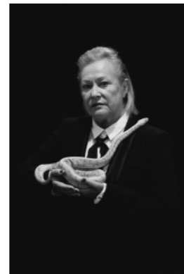
Here be Dragons