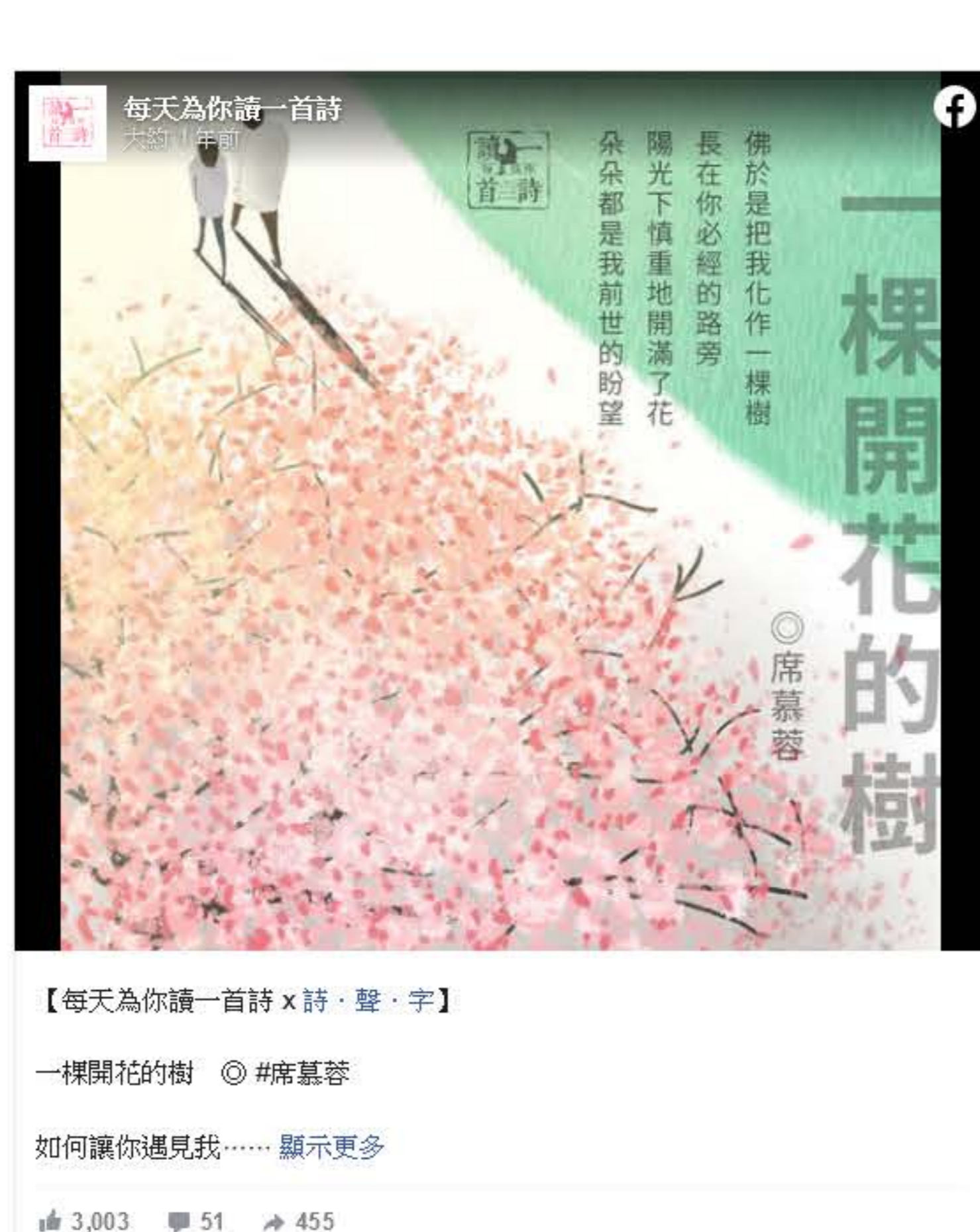
Facebook fan page

The main content of the "Every day , Appreciate a poem for you" team is to introduce a new poem to fans every day, with professional appreciation, author introduction and illustrations, and publish it on the Internet platform.