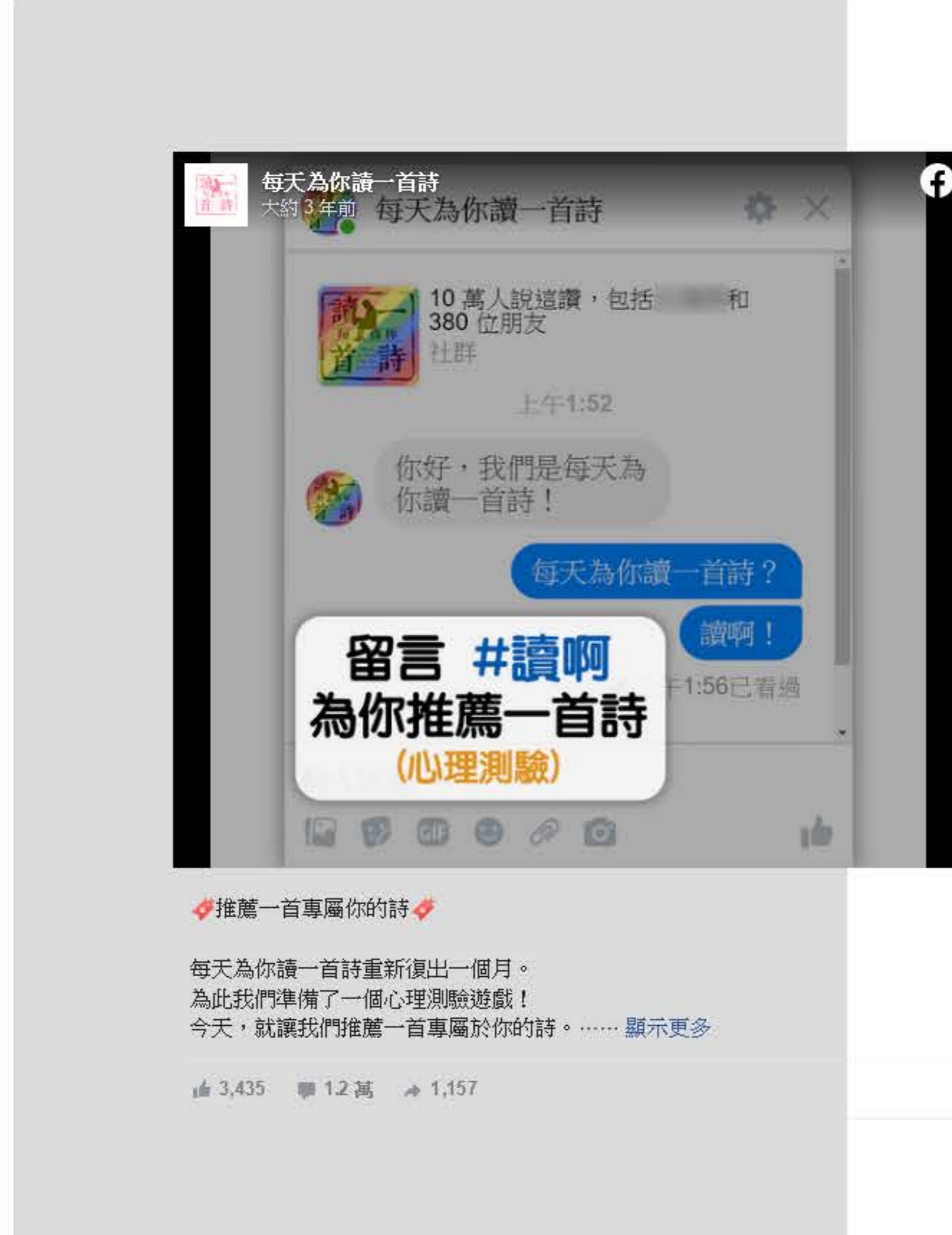
"Recommend a Poem Exclusive to You" psychological test

In addition to the appreciation, we are also trying other possibilities. For example, we combine information technology to create a psychological test game with a chatbot, and recommend a unique poem to readers. A total of 14,000 people left messages to participate.