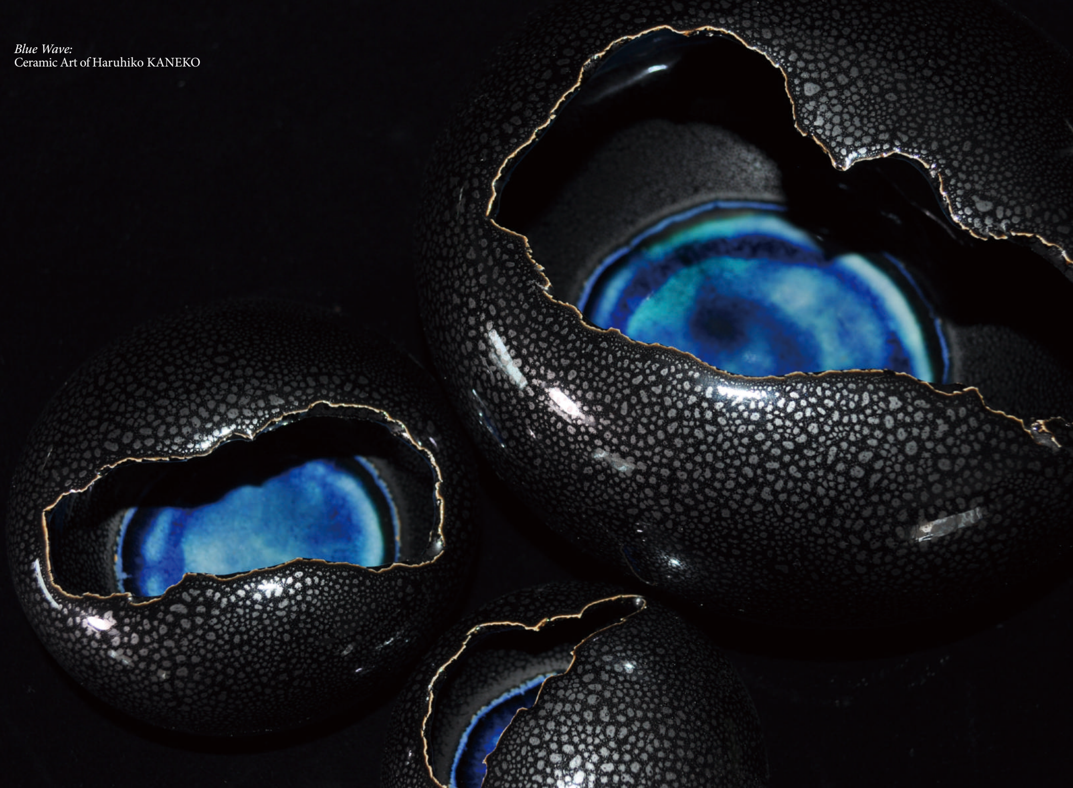
Blue Wave: Ceramic Art of Haruhiko KANEKO